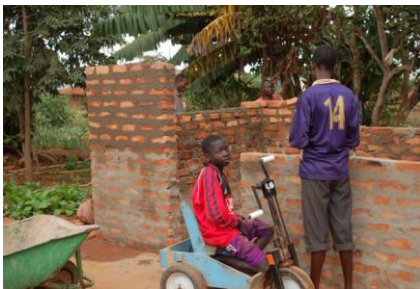
The chicken house under construction