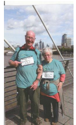
On the Jubilee Bridge on the final stage of the walk